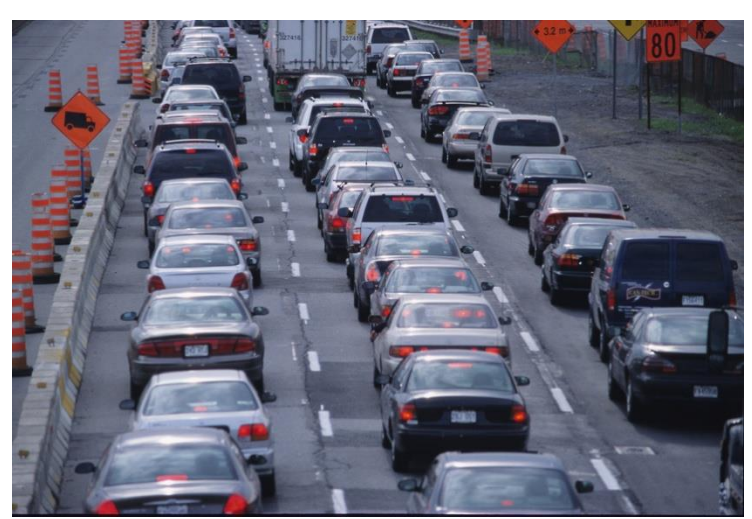
You want your website generating a lot of traffic

While creating a website is now a snap to do with today's easy to use technology, most websites have a low number of visits. They get very little traffic, if any. Much of this has to do with the design of the site. This includes both what you see and do not see on a web page.